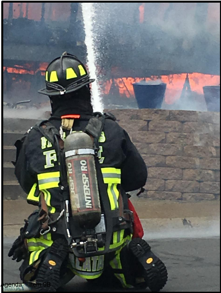
Agenda Item 9B